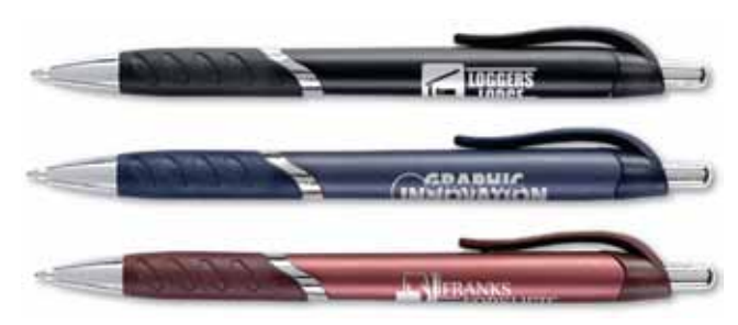
Metallic Blair Pens #MBL130 Starting at 300 @ $0.54 Bankers Idea Book

Brite Liner® Highlighters BIC® #BLG Starting at 300 @ $0.95 Bankers Idea Book