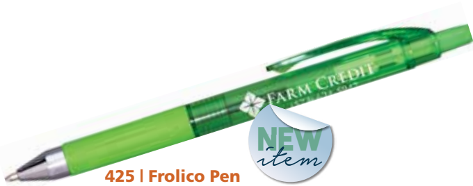
425 | Frolico Pen

Vibrant barrels, hybrid ink, and a jumbo comfort grip combine to create an exceptional writing experience your customers will appreciate. With ink colors and grips that coordinate with the barrels, this will be a colorful option to add to your next marketing campaign. The hybrid ink dries fast and resists smears for confident writing and drawing enjoyment. Imprint area: 1 3/4" x 1/2".